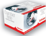
Chamber Brite Autoclave Cleaner

tvet™ autoclaves are for Veterinary use only, not to be used in Dental or Medical markets