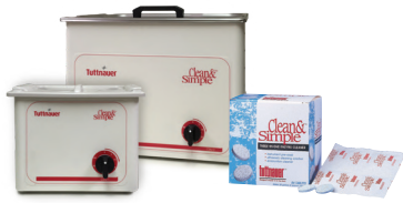
Clean&Simple™ Ultrasonic Cleaners and Tablets

For over 90 years, Tuttnauer's sterilization and infection control products have been trusted by hospitals, universities, research institutes, clinics and laboratories throughout the world. Supplying a range of top-quality products to over 100 countries. Tuttnauer has earned global recognition as a leader in sterilization and infection control.